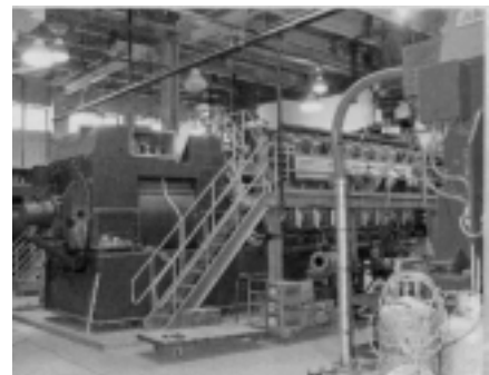
5 MW reciprocating engines