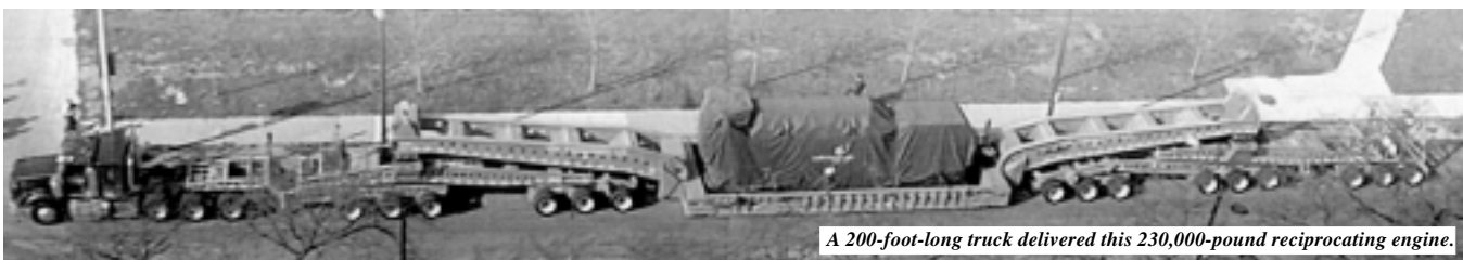
A 200-foot-long truck delivered this 230,000-pound reciprocating engine.